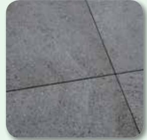
Observe directions for curing!