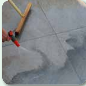
Clean with a hose spray ...