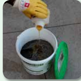
Add the binder component