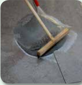
Work the mortar in