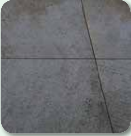
Clean the surface and remove all residues