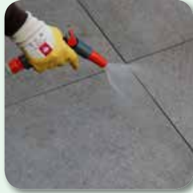
Wet the area