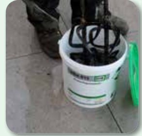
Mix thoroughly until homogeneous