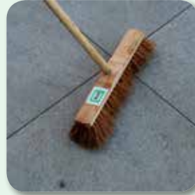
... and a damp coconut brush